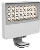
Quadralux Q2 LS9122 3,730 lm*, 33 W