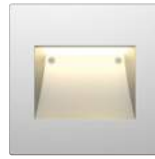
Nook NK4 LS1265