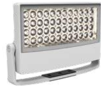
Quadralux Q6 LS9162 7,520 lm*, 80 W