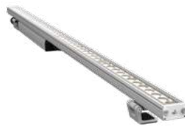
Linealux L3 LS9032 1,200 lm/ft*, 12 W/ft