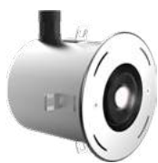
Nero NE1 LS333ANS-2LED