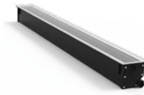
Terraluz TE5 LS3150