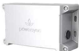
Data Injector PS4 LS6540