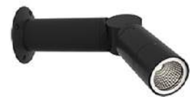
Omnio OM2 LS411COB