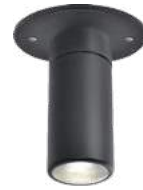
Medina ME1 LS134LED