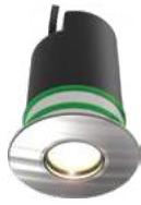
Vedita VE4 LS9404LED