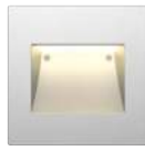
Nook NK2 LS1260