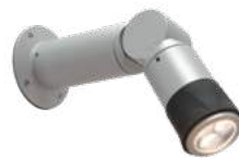
Omnio OM1 LS411LED

● Single Colour ● RGBW | RGBW ● Tunable White