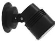
Centria C3 LS1015