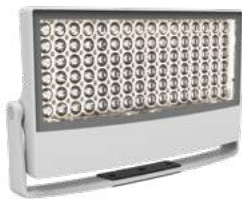
Quadralux Q8 LS9182 14,830 lm*, 132 W