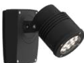
Centria C4 LS1012 2,560 lm*, 24 W