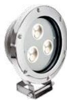
Tristar TR1 LS265LED