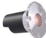
Vedita VE6 LS9406LED

● Single Colour ● RGBW | RGBW ● Tunable White