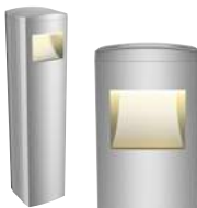
Rise RS8 LS2388