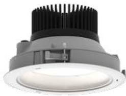
Soffito SF1 LS8950