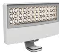
Quadralux Q4 LS9142 5,430 lm*, 48 W