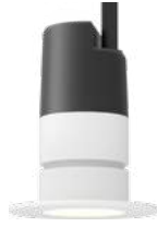
Vedita VE7 LS9407LED