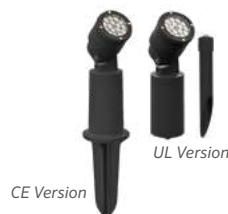
Centria C1 LS2012 2,560 lm*, 24 W