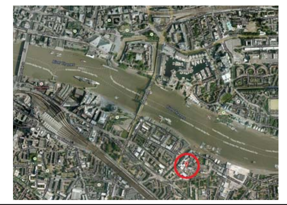
Issue Rev: comp 13.8.1